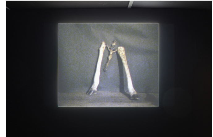
Michel Ritter, Animated movies, Untitled , 6'26", unknown date, Installation view Air Power = Peace Power , Kunsthalle Friart Fribourg, 2021. © Succession Michel Ritter, Paris.