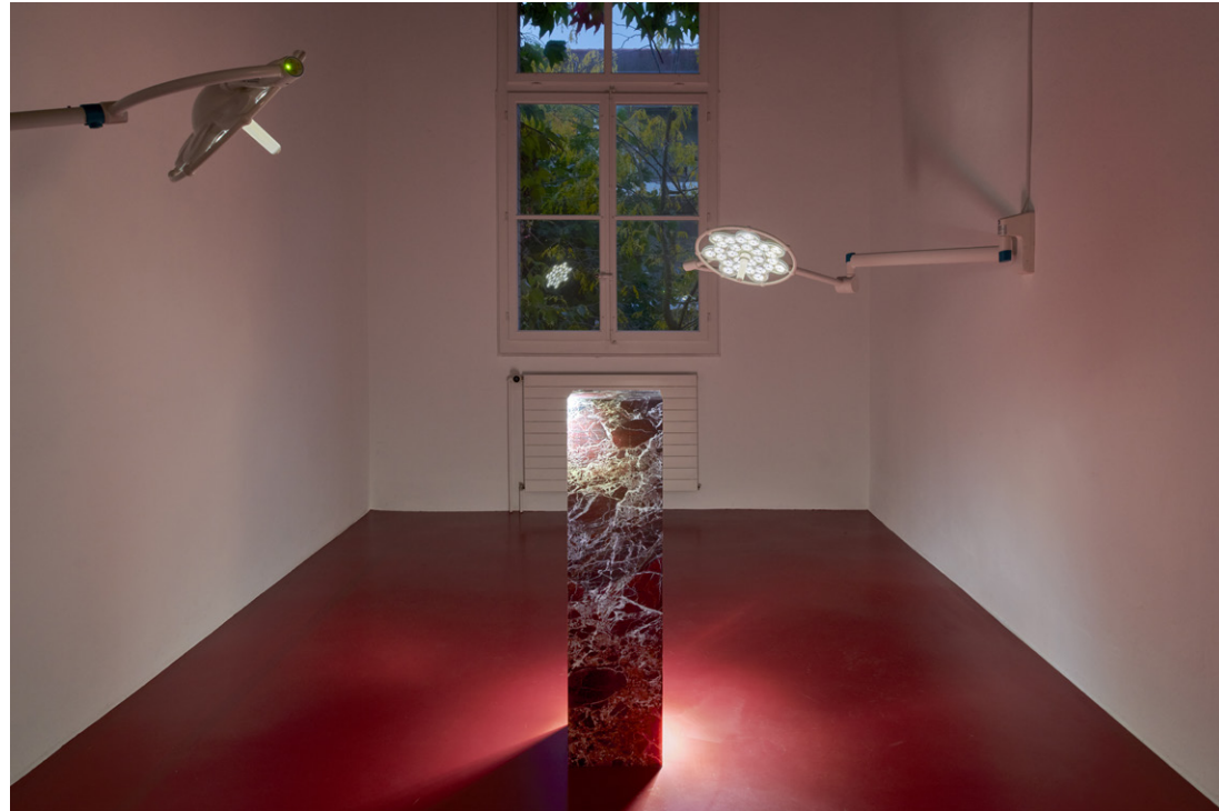
Exhibition view, Ceylan Oztruk, Matter of non , Kunsthalle Friart Fribourg, 2021.

The exhibition is accompanied by a prose text written by Ceylan Öztrük, which collects clues in a narrative space of its own. Finding its diffracted way through language and matter, spacing, as an idea and a practice, works allegorically.