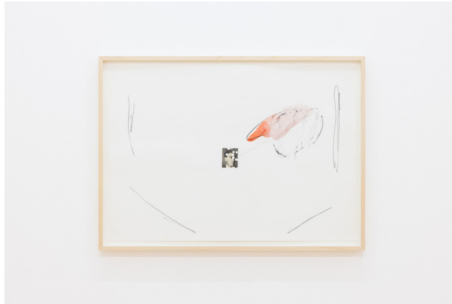
Michel Ritter, Untitled , ca. 1978. © Succession Michel Ritter, Paris.

The works reserve a significant place for emptiness, free space. The materials used give body to the air, to breath and put the accent on the ethereal, the gaseous state. This extreme state of matter symbolises the immaterial future of images, as well as the coming obsolescence that is the fate of each new image. This romantic derealisation places us face to face with a silent poetic justice that masks the militant dimension of a work activated by impotence in the face of the scandals of the present.