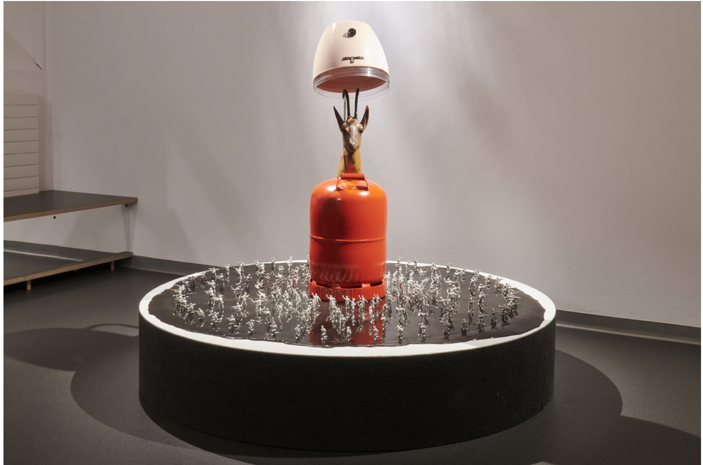
Michel Ritter, Untitled , ca. 1990, Installation view Air Power = Peace Power , Kunsthalle Friart Fribourg, 2021. © Succession Michel Ritter, Paris.

The title of the exhibition Air Power = Peace Power is taken from a slogan for an American Air Force recruitment campaign; a panel that the artist brought back in his suitcase from one of his stays in the US. This appropriation and the inversion of meaning it produces once inserted into this artistic context remind us how criticism of the domination of space is also, always, a poetic art in Michel Ritter's work.