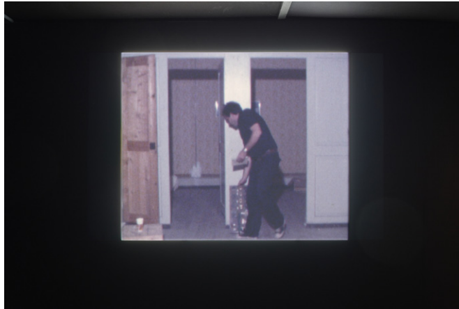
Michel Ritter, Untitled , 2'9", Fri-Art 81, Installation view Air Power = Peace Power , Kunsthalle Friart Fribourg, 2021. © Succession Michel Ritter, Paris. Photo Guillaume Python

The artist's films are inspired by conceptual cinema, and early video art strategies. They are often part of larger environments conceived by the artist. His animation films redistribute and document part of his assemblage and sculptural work.