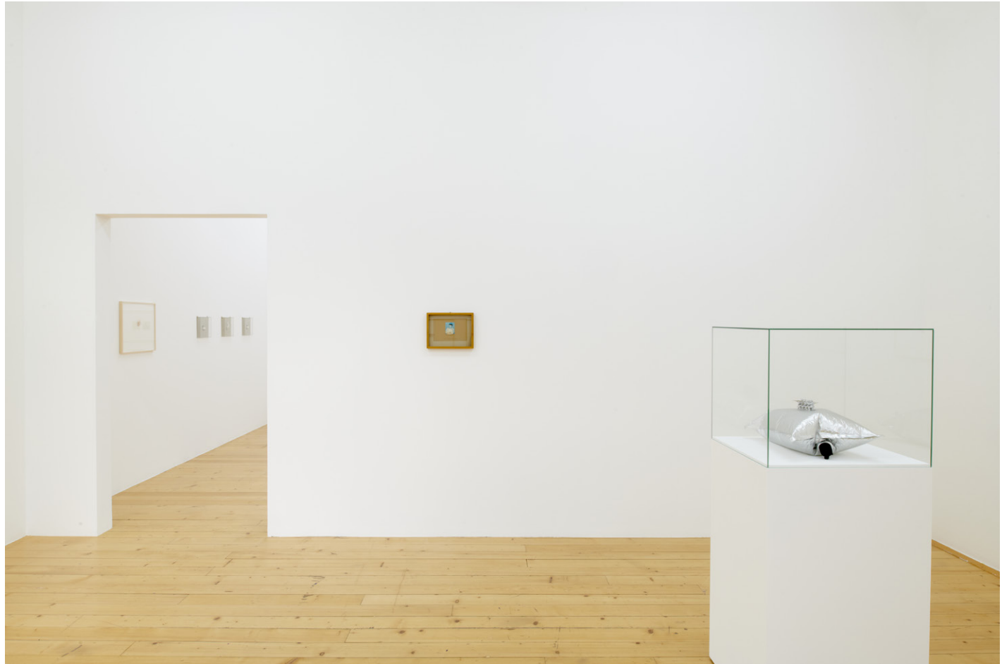
Exhibition view, Michel Ritter, Air Power = Peace Power , Kunsthalle Friart Fribourg, 2021.

From the 1970s to 2000, from Fribourg to New York, Michel Ritter produced a body of work of great coherence that drew on several notable influences: a critical sensitivity with respect to Western viewpoints inspired by worldwide travel during his youth, the Swiss artists to whom he was close and the conceptual practices and pictorial and media strategies of the art of the 1970s. By means of minimal interventions, the appropriation of everyday images and the unusual combination of everyday objects, the artist offered an oblique perspective on the visually saturated environment of the end of the last century. So doing, he also contributed to the shift towards a new anthropological apprehension of visual culture, whereby images were considered as much through an architectural, as a social and intellectual lens.