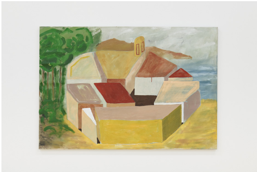
Huw Lemmey, Biblioteca , 2021 SECOND, Fri Art, 2021.

Listen to Becket MWN, Thing you need before leaving the house (on gradual construction of thought in text)