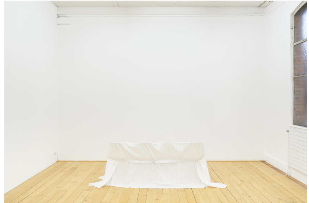
The Unplugged, Live from Fribourg, 2021, SECOND, Fri Art, 2021.