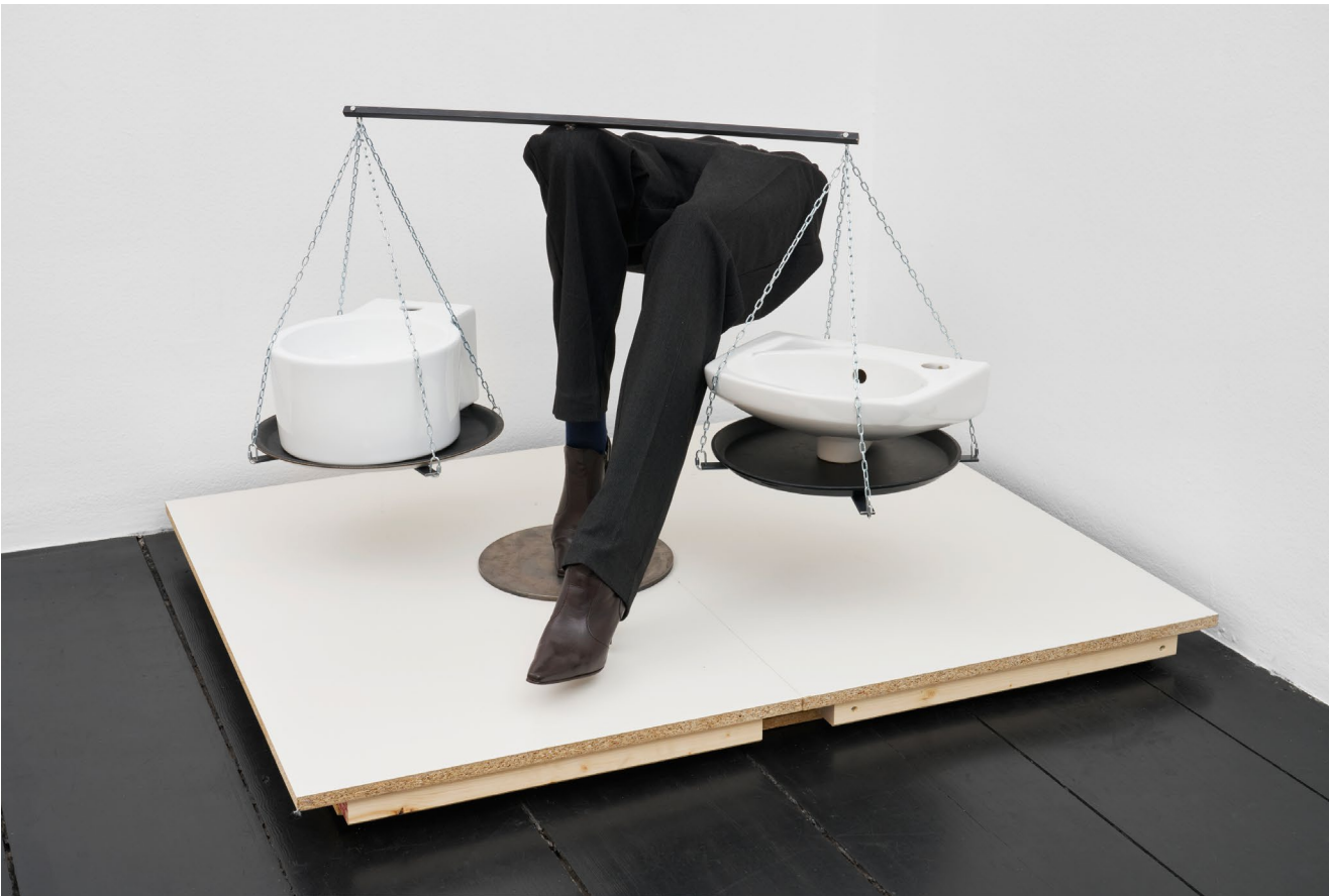
Morag Keil, Client (detail), 2024. Installation with desk, chair, laptop, mouse, keyboard, artist’s website, platform, mannequin legs, sinks, chain, trays, obs boards, dimensions variable. Courtesy the artist and Galerie Isabella Bortolozzi, Berlin / Photo © Graysc Cover page: Exhibition poster, graphic design : Eurostandard

1: Benjamin Noys, The Persistence of the Negative , 2012