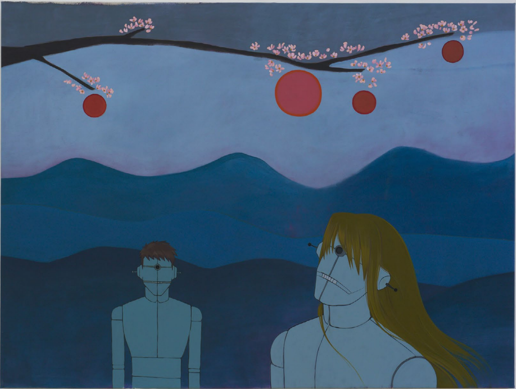
Jeremy, Le fruit , 2025.