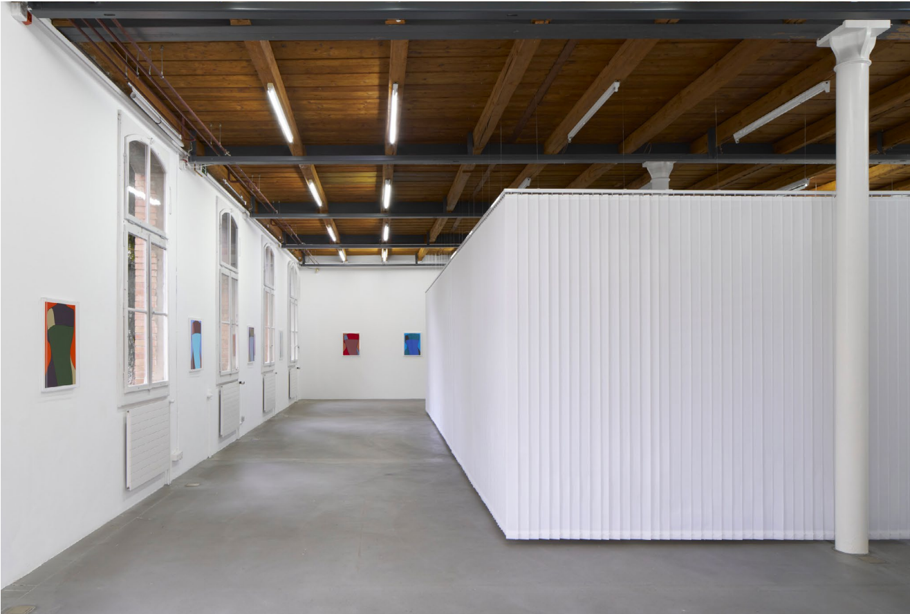
Exhibition view, Azize Ferizi, Spring / Summer 25 , Kunsthalle Friart Fribourg, 2025.