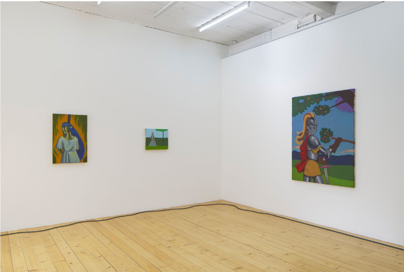
Exhibition view, Jeremy, Spring / Summer 25 , Kunsthalle Friart Fribourg, 2025.