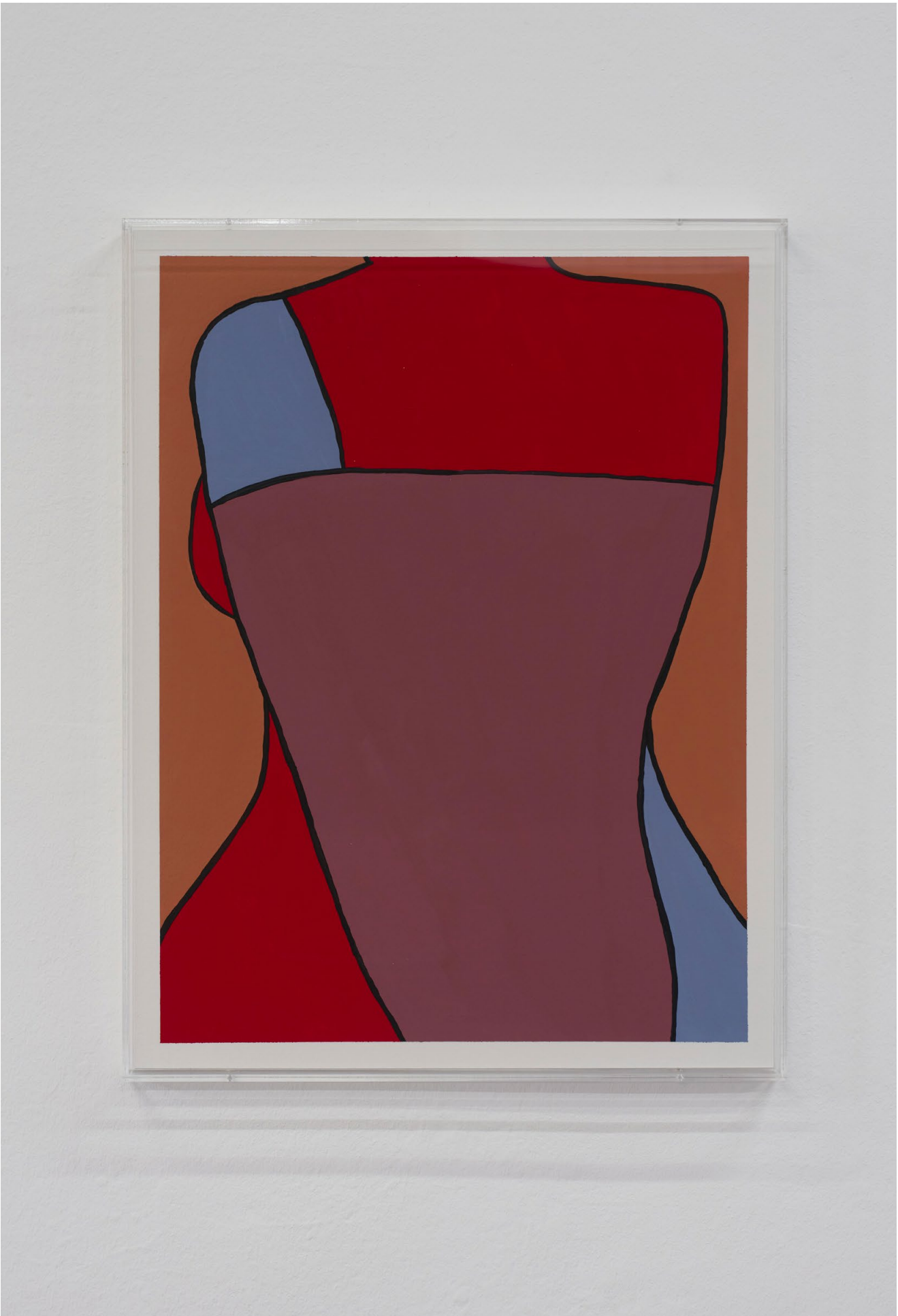
Azize Ferizi, Untitled, 2025.