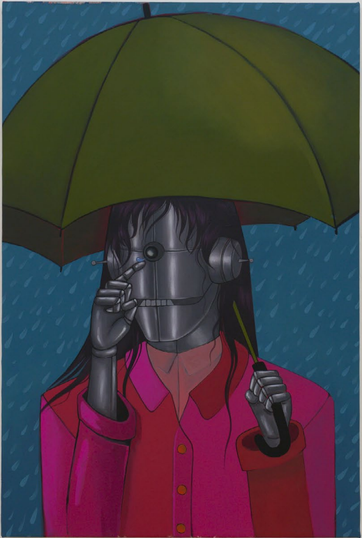
Jeremy, Jour de pluie , 2025.