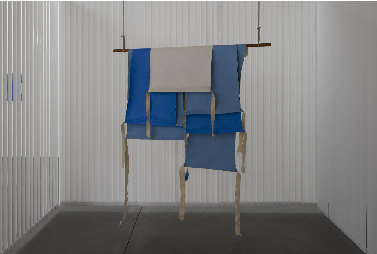
Azize Ferizi, maid (mother figure) , 2025.