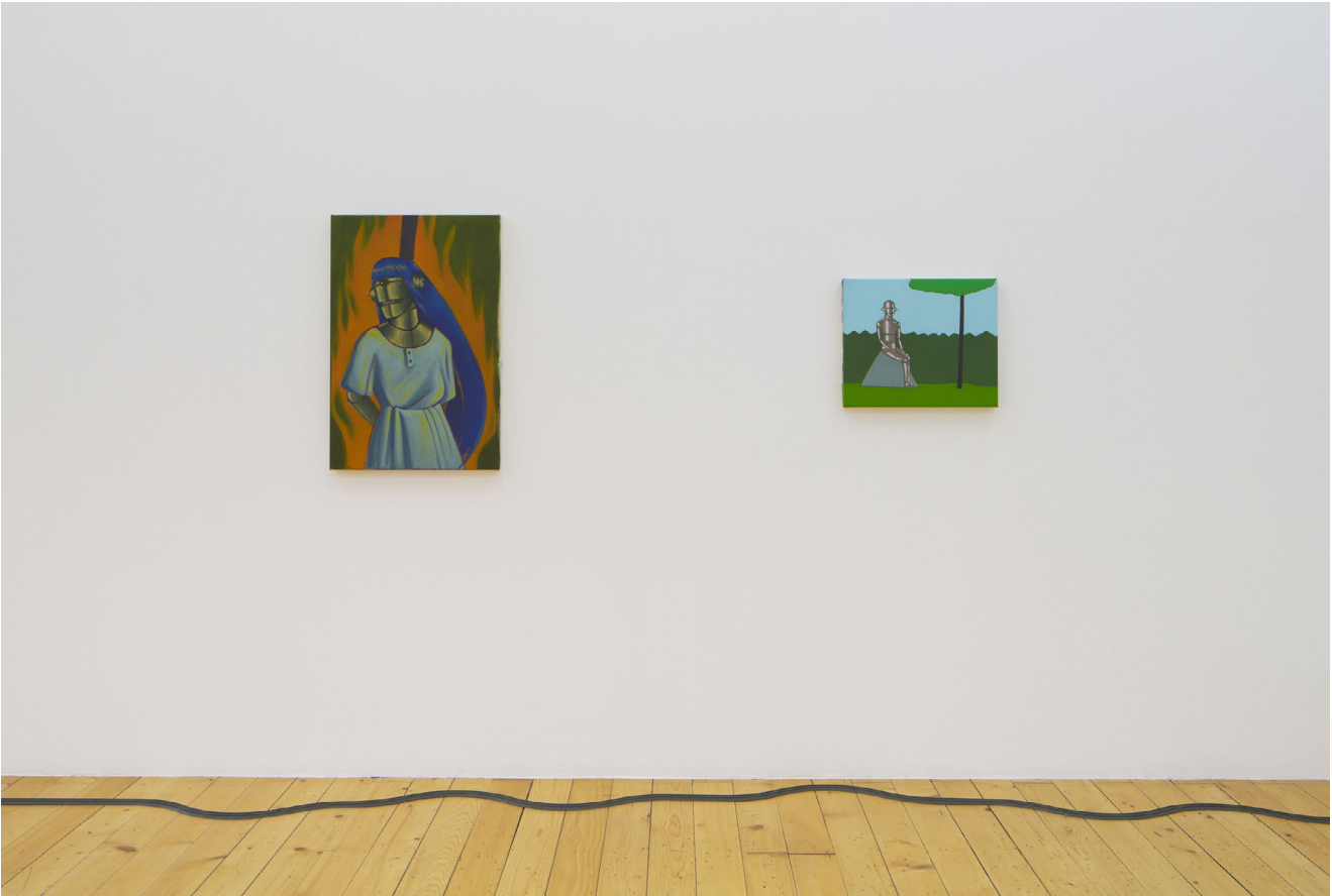
Installation view, Jeremy, Spring / Summer 25 , Kunsthalle Friart Fribourg, 2025. Photo: Guillaume Python